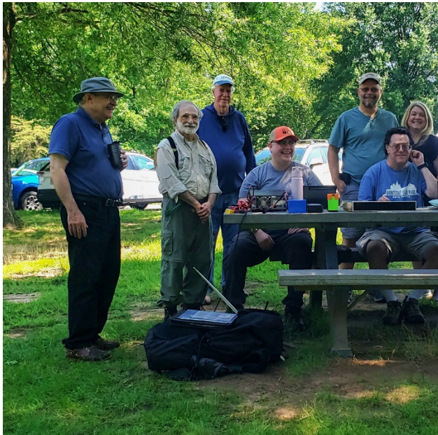
Hams in Maryland meeting for POTA