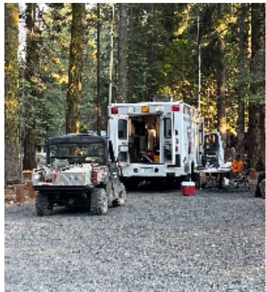
The command post for the rescue mission.

Young Stirling also had a hand with the rescue. He used his scout whistle to blow SOS, the internationally recognized Morse code distress signal, to give searchers a better chance of locating their position."