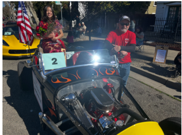
Miss Bok Kai