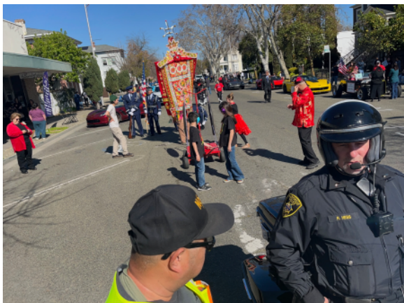
Parade Participates Getting Ready